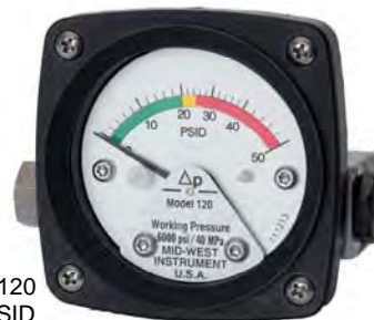
Model 120 0-50 PSID With Special 3 Color Dial

An optional maximum indication follower pointer provides automatic indication of maximum differential occurring during a time period or system cycle. Reversed pressure ports are optionally available to facilitate installation and readability depending on which side of a filter, etc., the instrument must be installed.