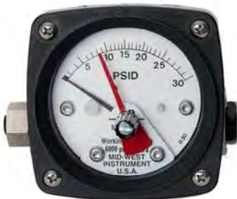
Model 120 0-30 PSID With Maximum Follower Pointer