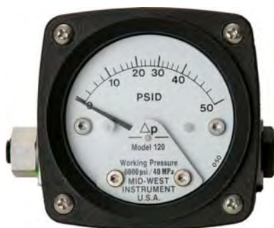
Model 120 0-50 PSID 2-1/2" Dial

A low cost differential pressure gauge for use in measuring the pressure drop across filters, strainers, separators, valves, pumps, chillers, etc., and for local flow indication and control.