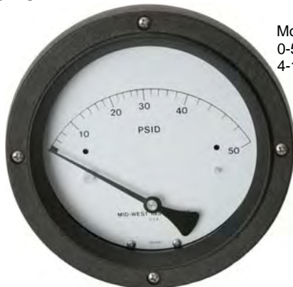
Model 120 0-50 PSID 4-1/2" Dial